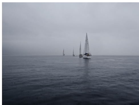
Bass Rock Race

Scott Shield ( JPR-1 ) - MISTY BLUE and SMIJ represented the Club racing against three RFYC Yachts in the first Joint Passage Race of the Season. Ruby Black did some sharp tooting, assisted by her parents, to ensure the race got off to good start. Once again the fleet was faced by strong and gusty winds but all finished the course in tight formation. Overall results still to be published but without doubt MISTY once again thrashed SMIJ to take the FCYC Scott Shield.