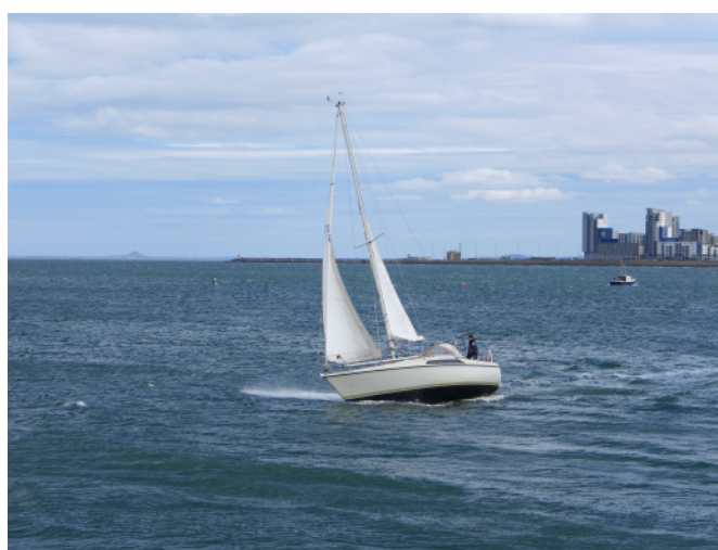
Stern Chase: Misty Blue

Scott Shield ( JPR-1 ) - MISTY BLUE and SMIJ represented the Club racing against three RFYC Yachts in the first Joint Passage Race of the Season. Ruby Black did some sharp tooting, assisted by her parents, to ensure the race got off to good start. Once again the fleet was faced by strong and gusty winds but all finished the course in tight formation. Overall results still to be published but without doubt MISTY once again thrashed SMIJ to take the FCYC Scott Shield.