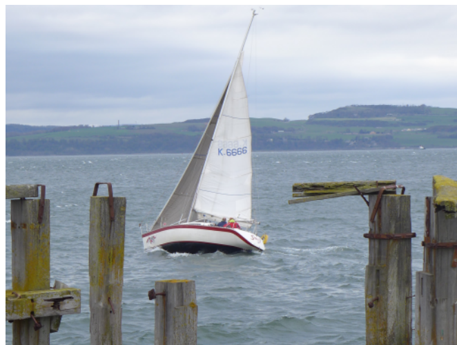
Stern Chase: Smij

stayed there, opening up her lead to finish a clear first and take the Stewart Salver.