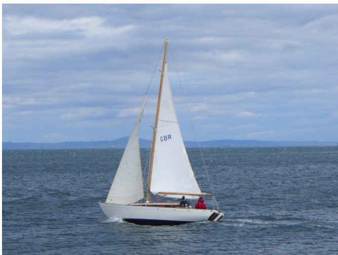
Stern Chase: Corsair

on nip and tuck to the finish with ECLIPSE edging into 1st Place, followed by KASHANGI II taking 2nd by a whisker from GUSTO coming in 3rd. A yard BBQ after sailing, which started in the sunshine, was enjoyed by all, until typically the cold wind returned with a vengeance, resulting in a mad rush to shelter in the Bell Block.