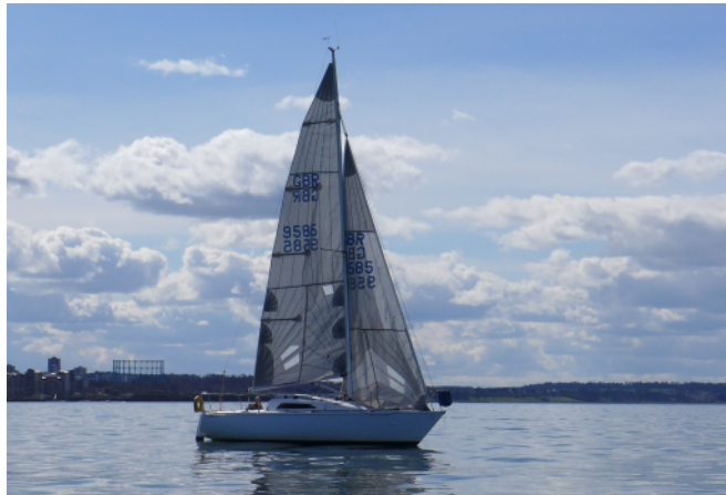
Opening Regatta: Eclipse

Despite very light and variable wind eight yachts started. As the fleet jostled for position for two hours it became clear that no one would complete the full course with the time limit and the Race Officer shortened course near East Gunnet. Three Yachts crept