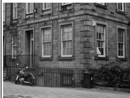
1 Granton Square