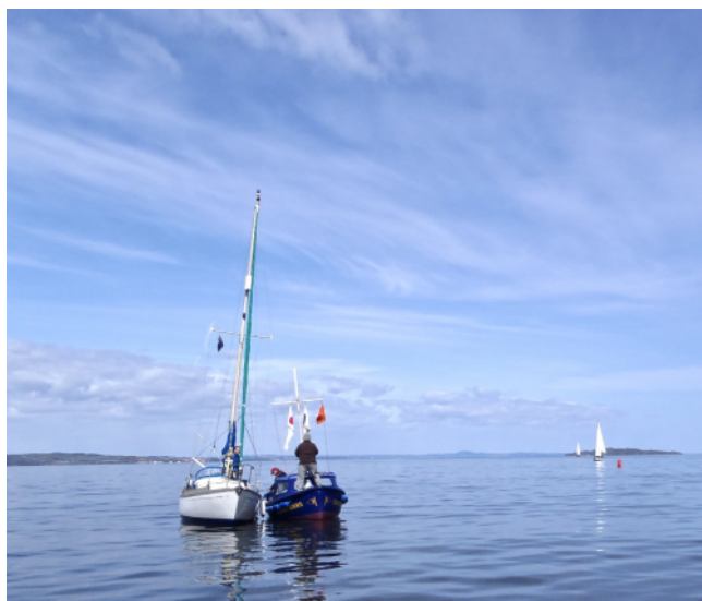
Opening Regatta: the finishing line