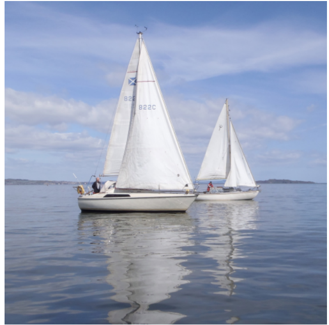
Misty Blue and Sapphire