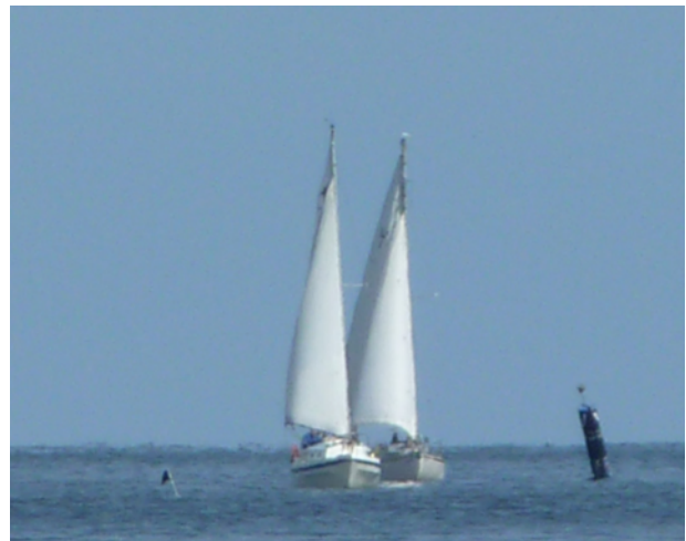
The Battle of the Bilgers