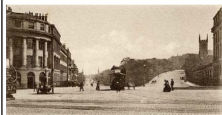
Blenheim Place and Royal Terrace

following a barney at the Hotel!) the club had relocated to Melville Villa in Granton Road.