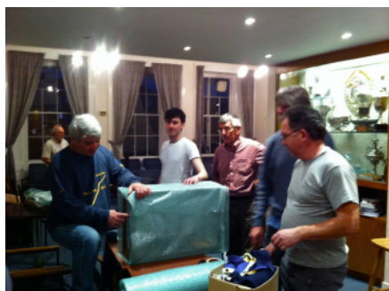
Packing up the Treasures