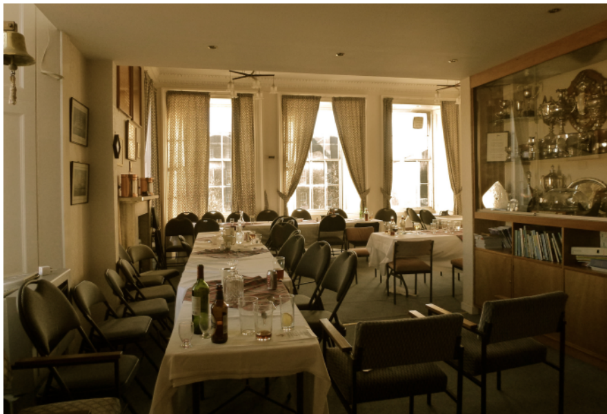
The morning after: the last Burns Supper

Saturday 31st March marked the end of our occupancy of the Clubhouse at 1 Granton Square which began in 1968. This followed the Special General Meeting which had been called on 19th December 2011 and which unanimously agreed to pursue development opportunities and sell the clubhouse.